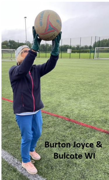
Burton Joyce & Bulcote WI

Burton Joyce & Bulcote WI play Walking Netball every Monday morning at the Poplars Sports ground in Burton Joyce. No mean