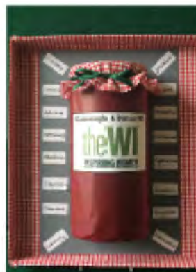
Clarborough & District