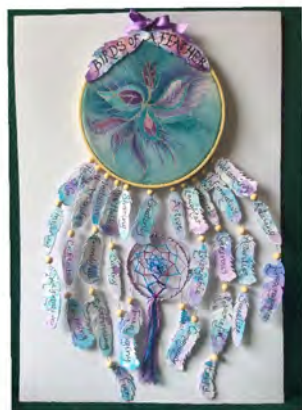
Birds of a Feather

These were created in 2019/2020 and would have been on display at the Annual Federation Meeting.