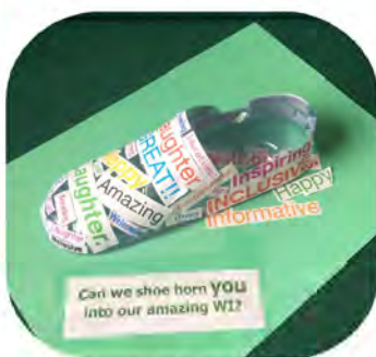
Blidworth & Rainworth

Yet 5 more photographs, taken of the entries for the Sheila Norris Challenge. This Challenge was for everyone in your WI to participate and to be creative. Every member had to write down one word that sums up their WI. The challenge was how the words could be displayed. There were 25 entries!