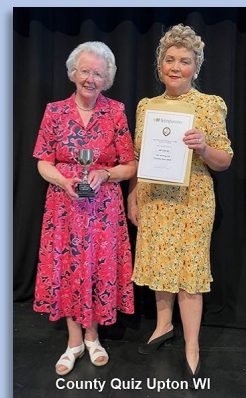
County Quiz Upton WI