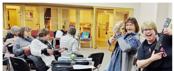
Workshop Wonders WI members enjoying a ukulele session at a recent meeting.