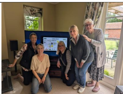
The Epperstone WI Watch Party members enjoying the NFWI Annual Meeting